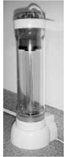
Figure 2 Counter-top stand mounting

Find a suitable location for your unit, and simply place it with the stand provided. Excess hose and/or power cord may be wrapped inside the unit's stand (Figure 2).